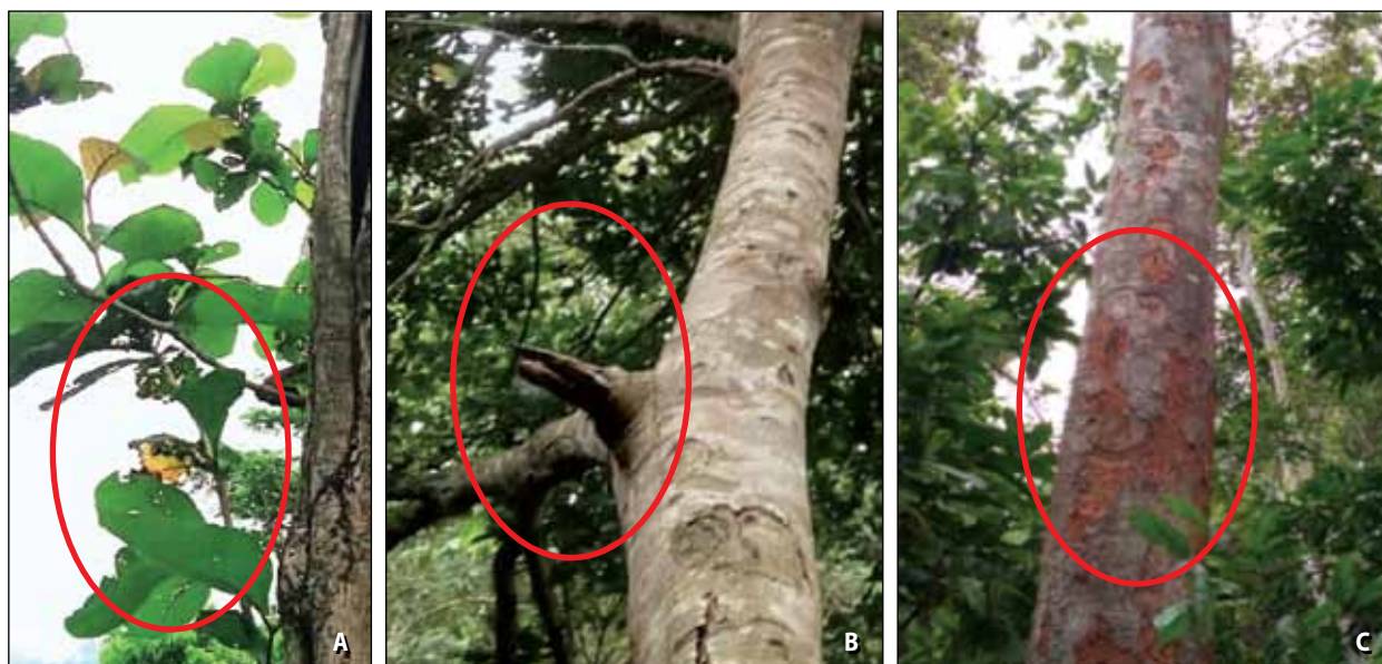
Figure 3. Types of damage: A – damaged foliage on teak trees ( Tectona grandis ); B – broken branch on jengkol trees ( Achidendron pauciflorum ); C – open wounds on petai trees ( Parkia speciosa )

leaves, which are no longer green, turn yellow, fall off and also have holes due to pests (Safe'i et al. 2021).