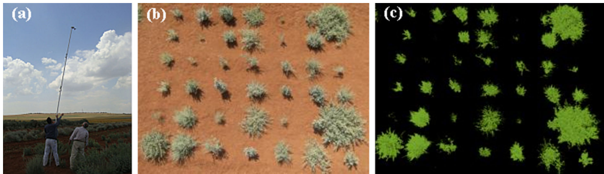
Fig. 2 Estimation of shrub canopy cover using a digital camera mounted on a monopod 6 m above the ground: a image collection with the equipment, b natural image of the shrub

community on the ground and c extracted image of the canopy coverage of the shrub community from the digital image using image processing VegMeasure program