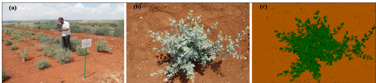
Fig. 1 Estimation of shrub canopy cover using a digital camera mounted on a monopod 1.5 m above the ground: a image collection with the equipment, b natural image of a shrub plant

on the ground and c extracted image of the canopy coverage from the digital image using image processing VegMeasure program