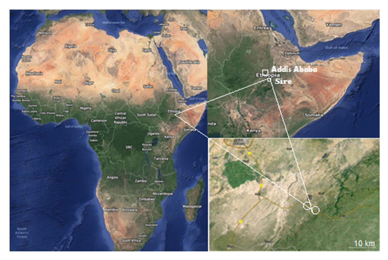
Fig. 1 Location of the studied plots, Sire Ethiopia (Google Maps 2018)

Sire is rain-fed and uses little external inputs and therefore is low-yielding and dependent on weather conditions (Demeke et al. 2011). Sire represents an agroecological zone that can be characterized as cool subhumid. The mean annual temperature and precipitation are 15–20°C and 532–1123 mm, with a mean of 868 mm, respectively.